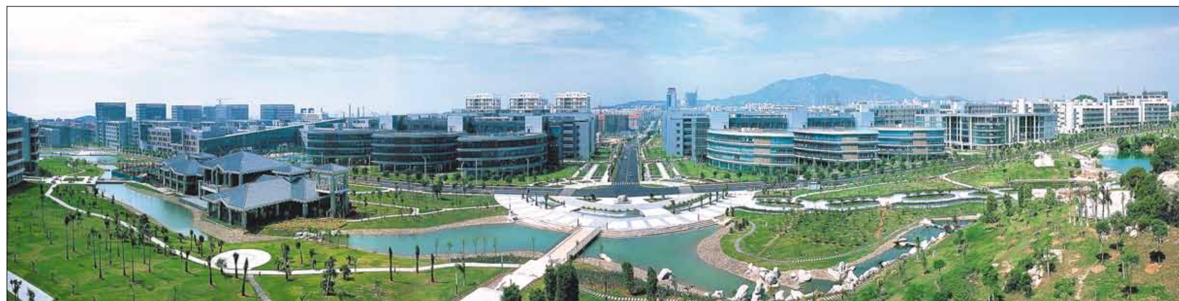
The second phase of the Software Park at the Xiamen National Torch Hi-Tech Industry Development Zone, or Torch Hi-Tech Zone for short.