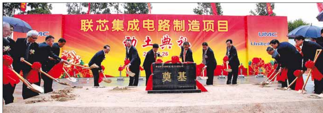
A ceremony to mark breaking ground for a foundry, a joint venture between the United Microelectronics Corporation, Xiamen city government, and Fujian Electronics and Information Group, was held in Xiamen, Fujian province, on Thursday.