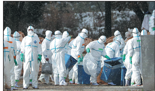
Workers wearing protective suits cull ducks after some tested positive for H5 bird flu at a poultry farm in Aomori, Japan, on Wednesday.