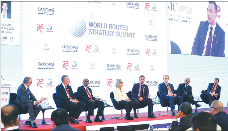
World Routes, the world's top aviation conference, is held in Chengdu in April.

This year has seen more than 520 major events held in Chengdu, covering an exhibi-