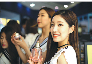
Left: The Chengdu motor show, held in September, is Southwest China's most influential event in the auto sector. Right: The China Beauty Expo joins hands with the Chengdu Beauty Expo.