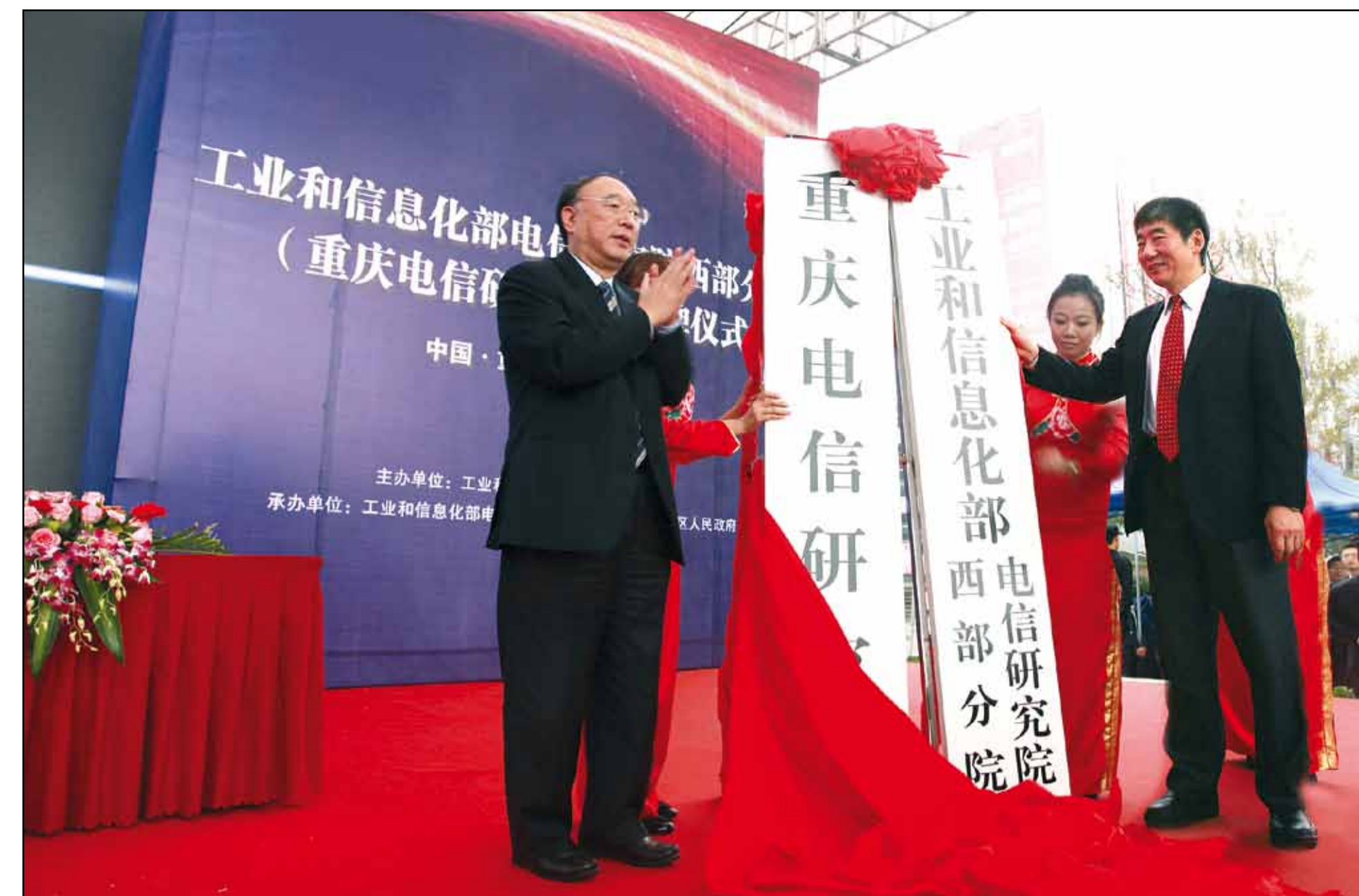
China's Academy of Telecommunication Technology established its western institute in October of last year to provide stronger support for IT industries.