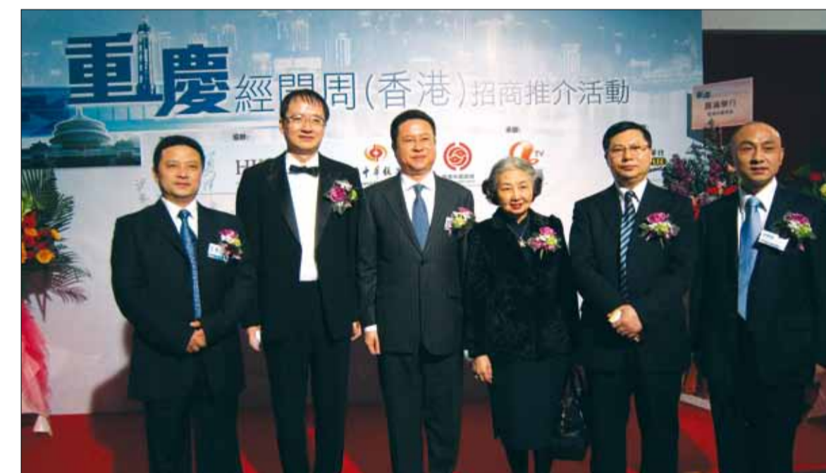
The delegation from the development zone visited Hong Kong in February, securing 15 billion yuan of investment.

trates on logistics, shipbuilding, and port-related industries.