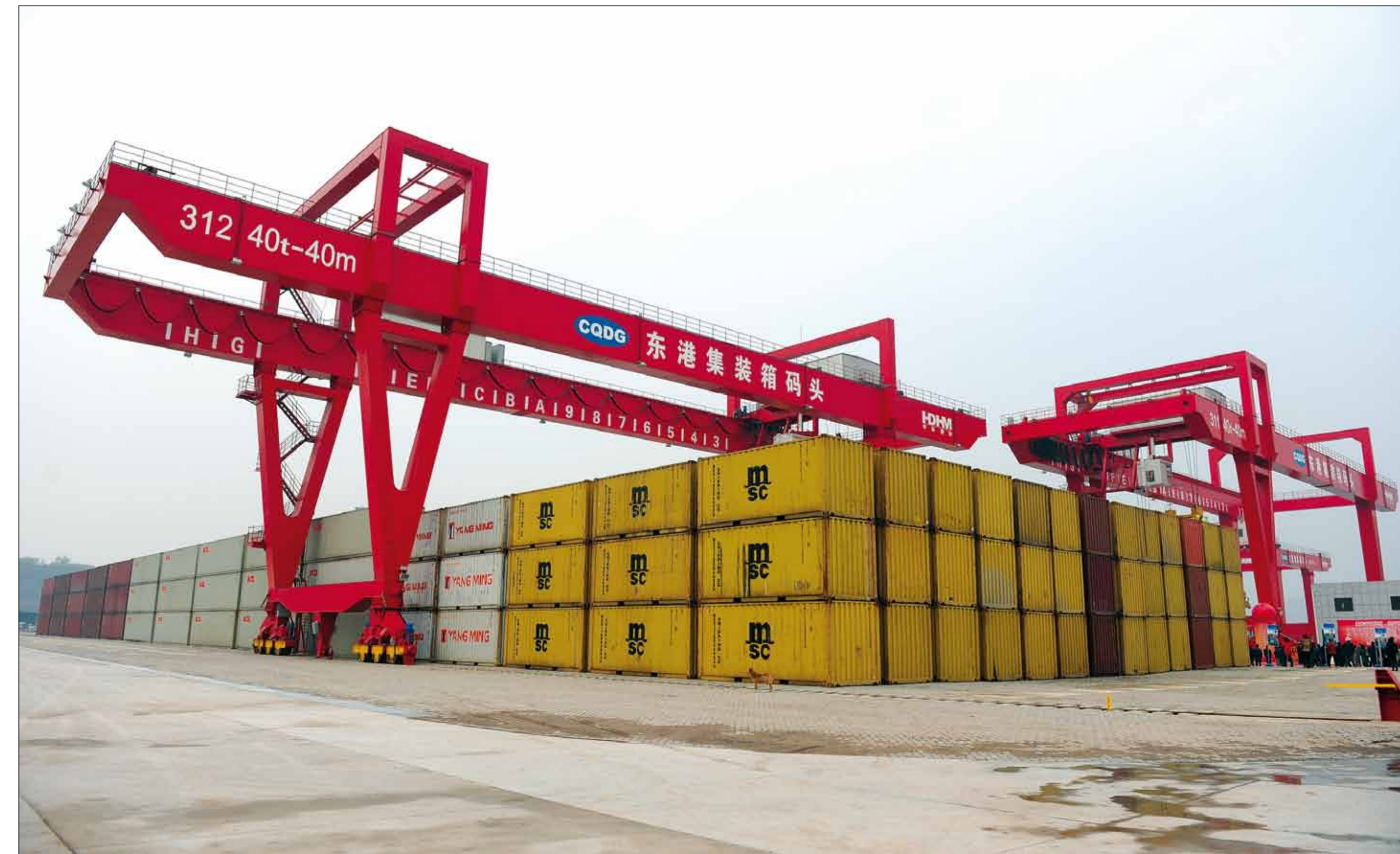
The Yangtze River port allows containers of locally made products such as these, to be delivered easily to the rest of the country and abroad.