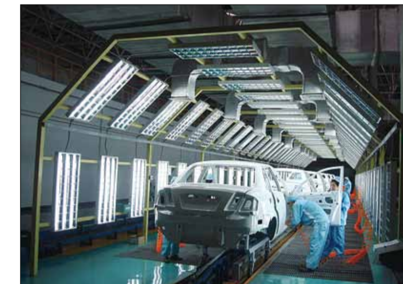
Automobiles are a traditional focus of the zone.

Its foreign trade volume was worth $2 billion the same year, a growth of 31 percent from the previous year.