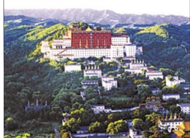
Putuo Temple in Chengde