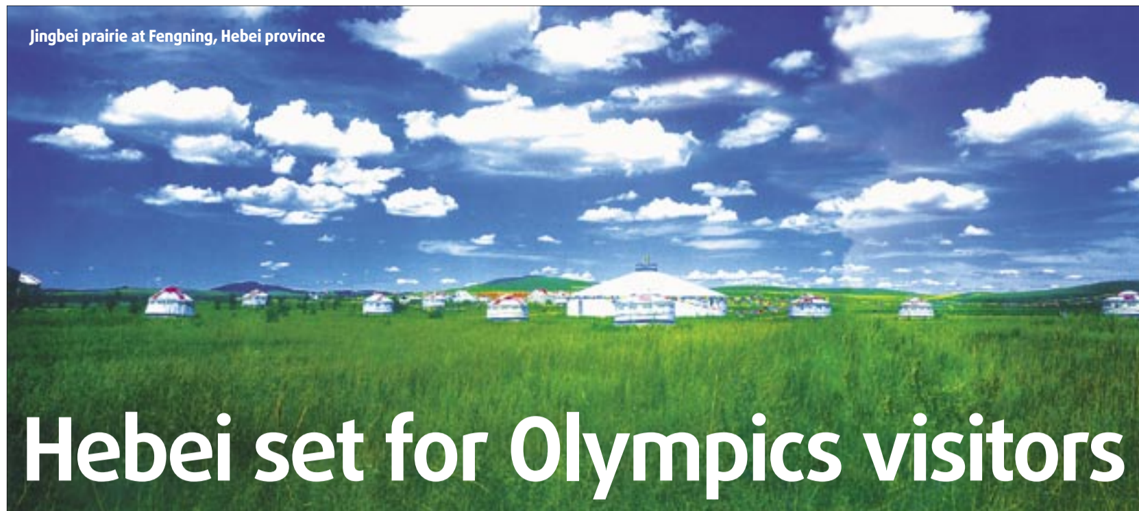
Jingbei prairie at Fengning, Hebei province