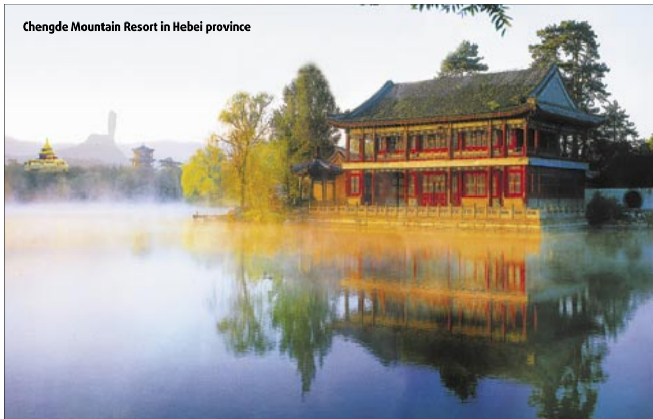
Chengde Mountain Resort in Hebei province