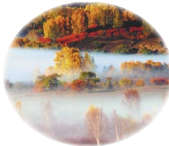
Autumn at Mulan royal hunting ground in Hebei province