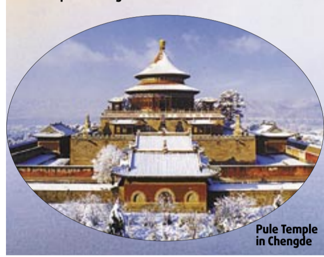
Pule Temple in Chengde