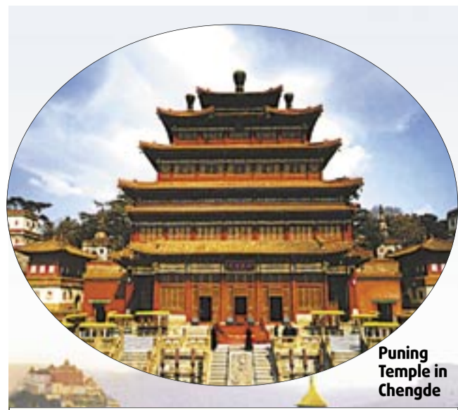
Puning Temple in Chengde