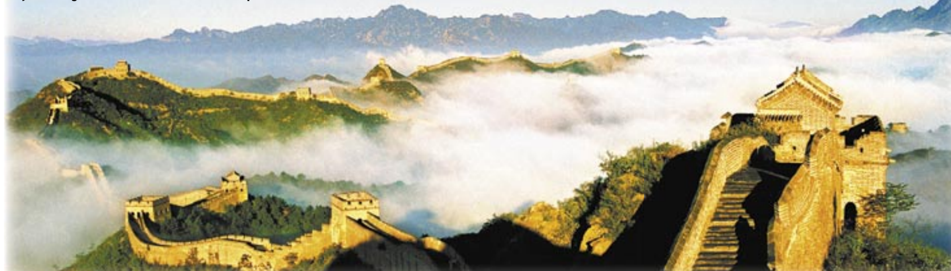
Jinshanling section of the Great Wall in Hebei province

The grasslands are home to mostly Manchurian and Mongolian people who may invite you to join them.