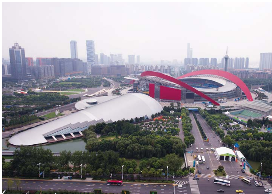
An overall view of the Nanjing Olympic Sports Center.

Medical facilities include four stations, 10