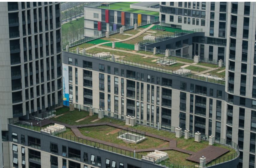
Plants are used on the top of buildings to provide insulation.