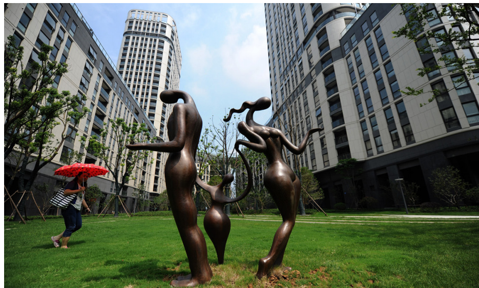
Sculptures enhance the village.

O utside of the sporting arenas, the athletes taking part in this year's Youth Olympic Games need places to relax and unwind after practice or competition and Nanjing has them in spades. From shopping malls to wide-open relaxation areas and communication centers, the city, and in particular the athletes village, has it all. The village area is also environmentally friendly and expected to provide locals with places to explore and enjoy for years to come.