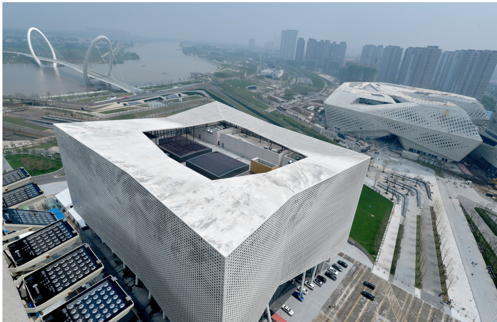
Building No 1 in the village includes a reception center, volunteer lodging as well as a dining hall for athletes.