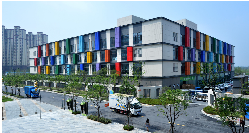
A multifunctional building in the village.