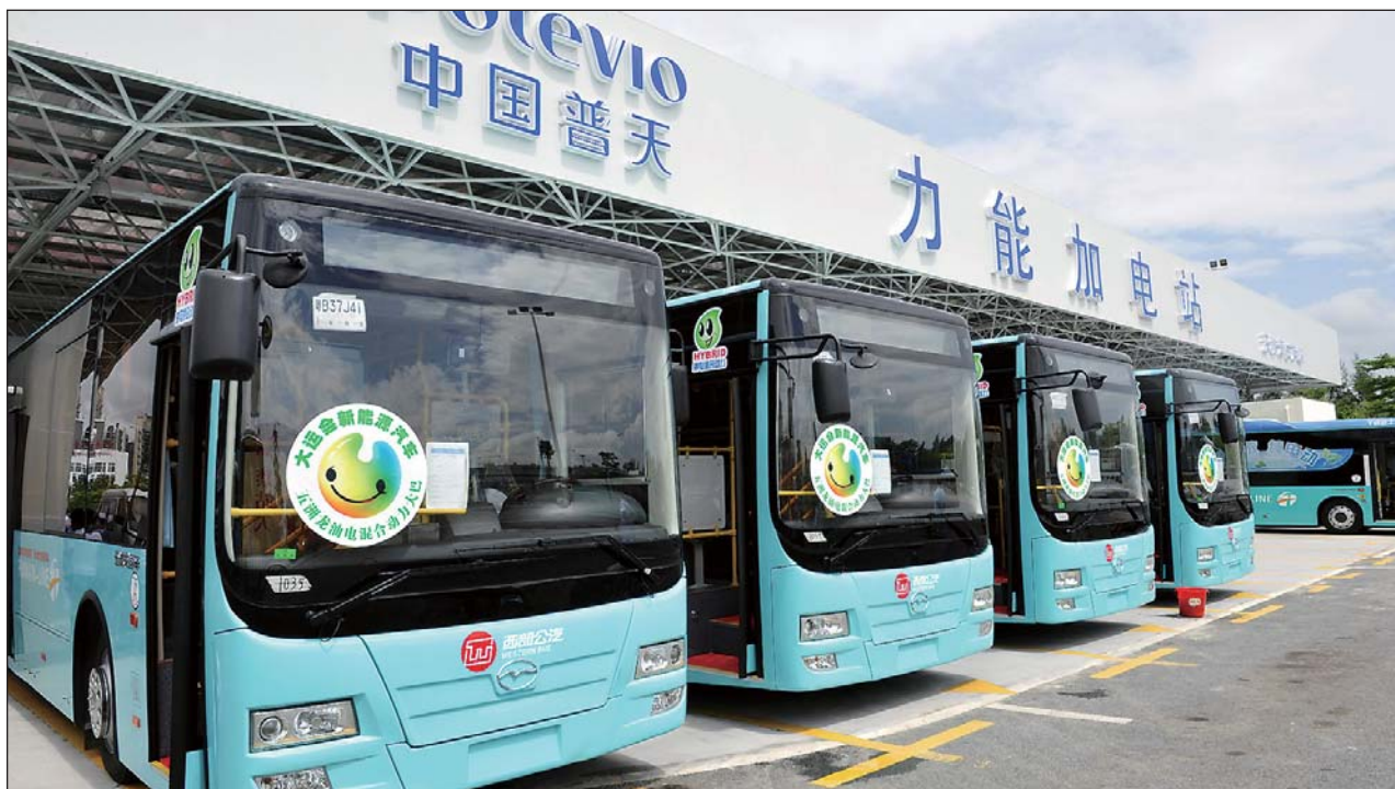
New-energy automobiles will be put into use during the Universiade.