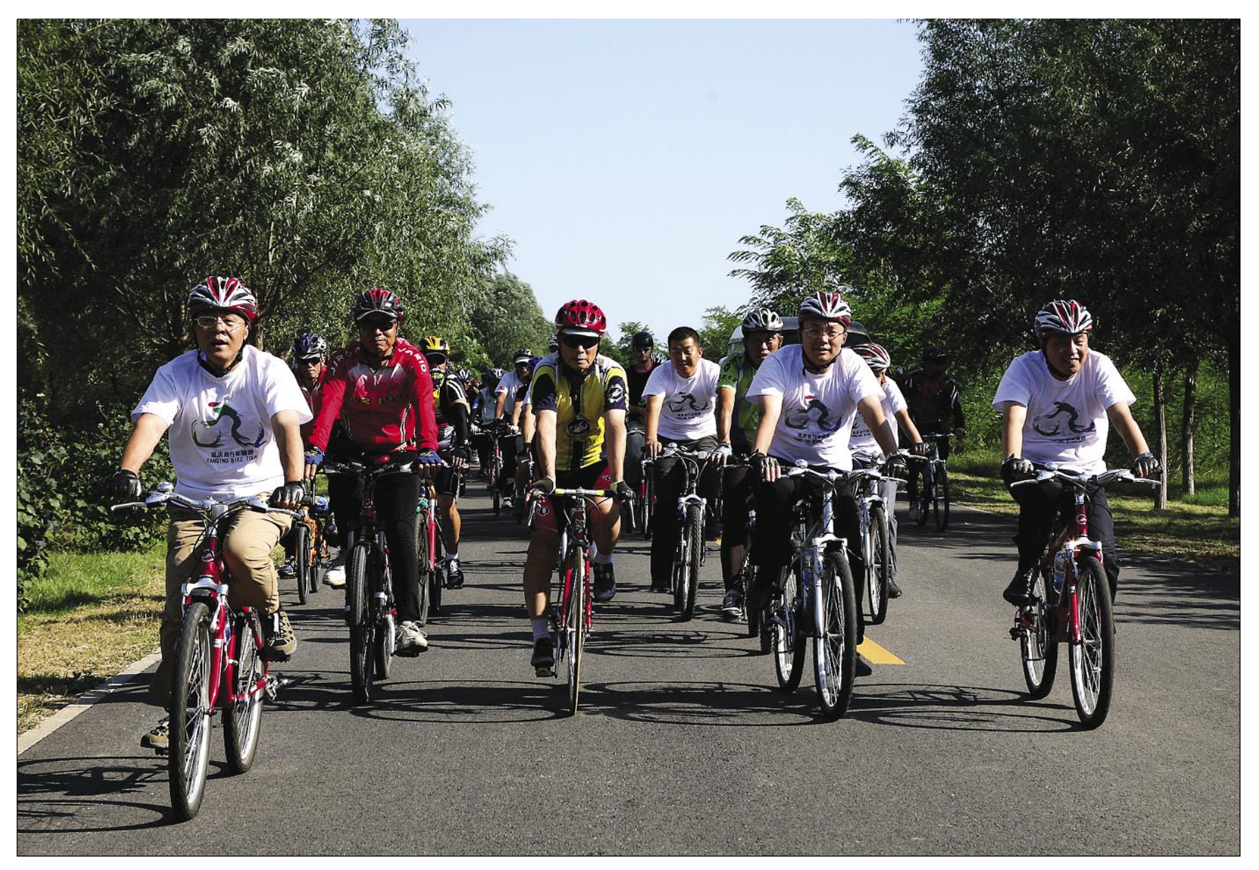
Bicycling isn't just for the pros. Yanqing has thousands of amateur cyclists and a number of cycling clubs in both urban and rural areas.