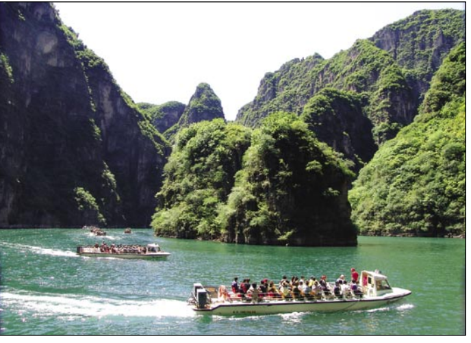
The beautiful landscape of Longging Gorge in Yanging county.

The bike touring covers a 20-km course, starting and ending at the same point (Guichuan Square), and passing through the Wanmu Riverside Forest Park. The starting point is on the south bank of Huanhu Lake, then going to Guanting Bridge, Yannong Road, South Rd in the Kang'an District, and back to Guichuan Plaza. The path is a 6-meter-wide smooth asphalt surface. The surrounding environment includes Xiadu Park, Youjing Gardens, Taidi Gardens, and Guishui Park.