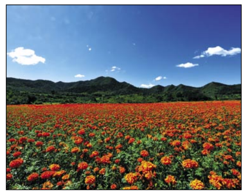
A field of marigolds.

Cycling activities are now giving Yanqing a brand image, so it is aiming at becoming China's "first cycling county".