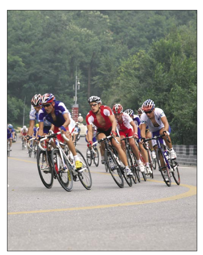
LANG FENGJIE / FOR CHINA DAILY