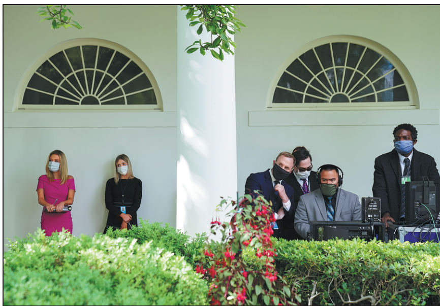
White House Press Secretary Kayleigh McEnany (far left) and other staff all wearing face masks listen as US President Donald Trump holds a COVID-19 response news briefing in the Rose Garden of the White House on Monday.