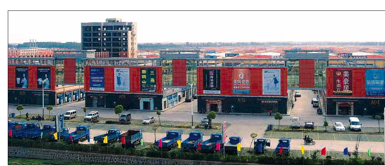
Golden Sun Home Décor City is the area's largest trade and warehousing facility for home décor and building materials.

According to the Lai'an county government's 12th five-