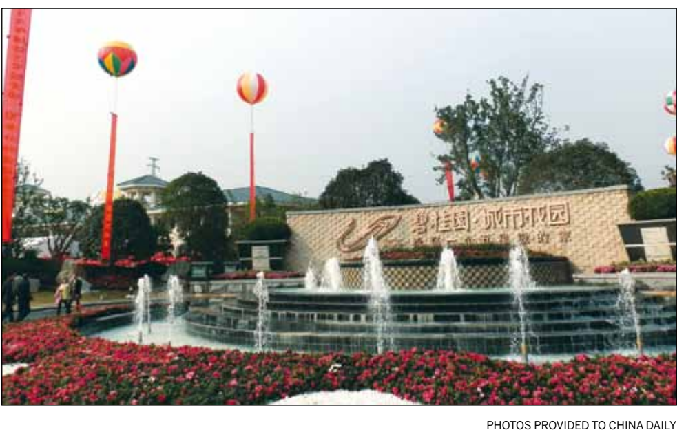
PHOTOS PROVIDED TO CHINA DAILY Country Garden is investing 40 billion yuan in building a large residential community in Chahe.

more than 32 km of roads, put up 12 bridges, fixed 820 street lamps, and laid down 19.3 km of water pipes, and 19.9 km of telecommunication cables.