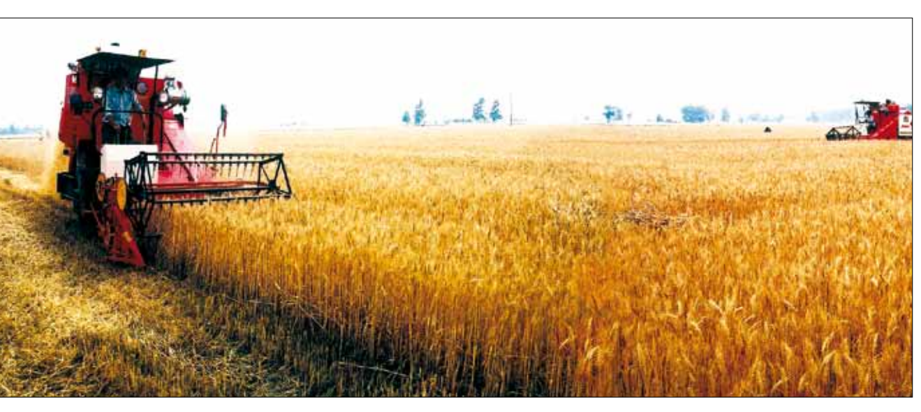
Reaping a bountiful harvest near Lu'an, a key agricultural center that ranks near the top in China in yearly output.

Foziling Reservoir, one of six major reservoirs in Lu'an, Anhui province, a major source of hydroelectric power for the area.