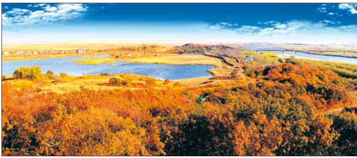
Clockwise from top: Breathtaking view of the Changbai Mountains in Jilin. Changbai Mountains are an icy wonderland in winter. Xianghai wetland, home of the red-crowned crane and many other species of exotic birds. Aerial view of the Fangchuan National Scenic Zone.