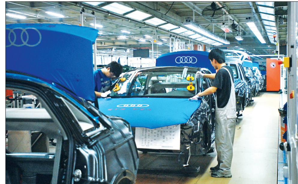
Employees work at the production lines in a factory of FAW-Volkswagen Automotive Co Ltd.

The cultural industry has also caught the eye of policymakers. Jishi Media Co Ltd, a cable TV operator based in