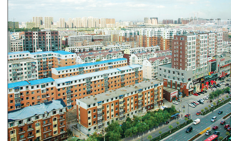
The Warm Houses Project is part of the provincial government's overall plan to improve quality of life in recent years.

The first subway line in Changchun is expected to be complete by 2015, and it will cross the city north to south, with 15 stops over an