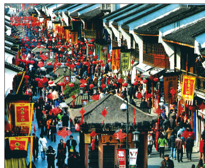
With a long history, the Wushan temple fair is one of the most crowded fairs in Hangzhou.