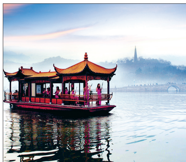
The city has been known as "the earthly paradise".

When night falls, the West Lake sits quietly and calmly among shimmering lights. After dinner at North Mountain Road, one can have a wonderful experience strolling leisurely on the Bai Causeway and the Su Causeway.