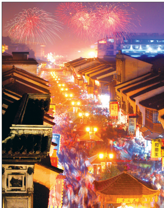
The new look of an ancient street in Hangzhou.