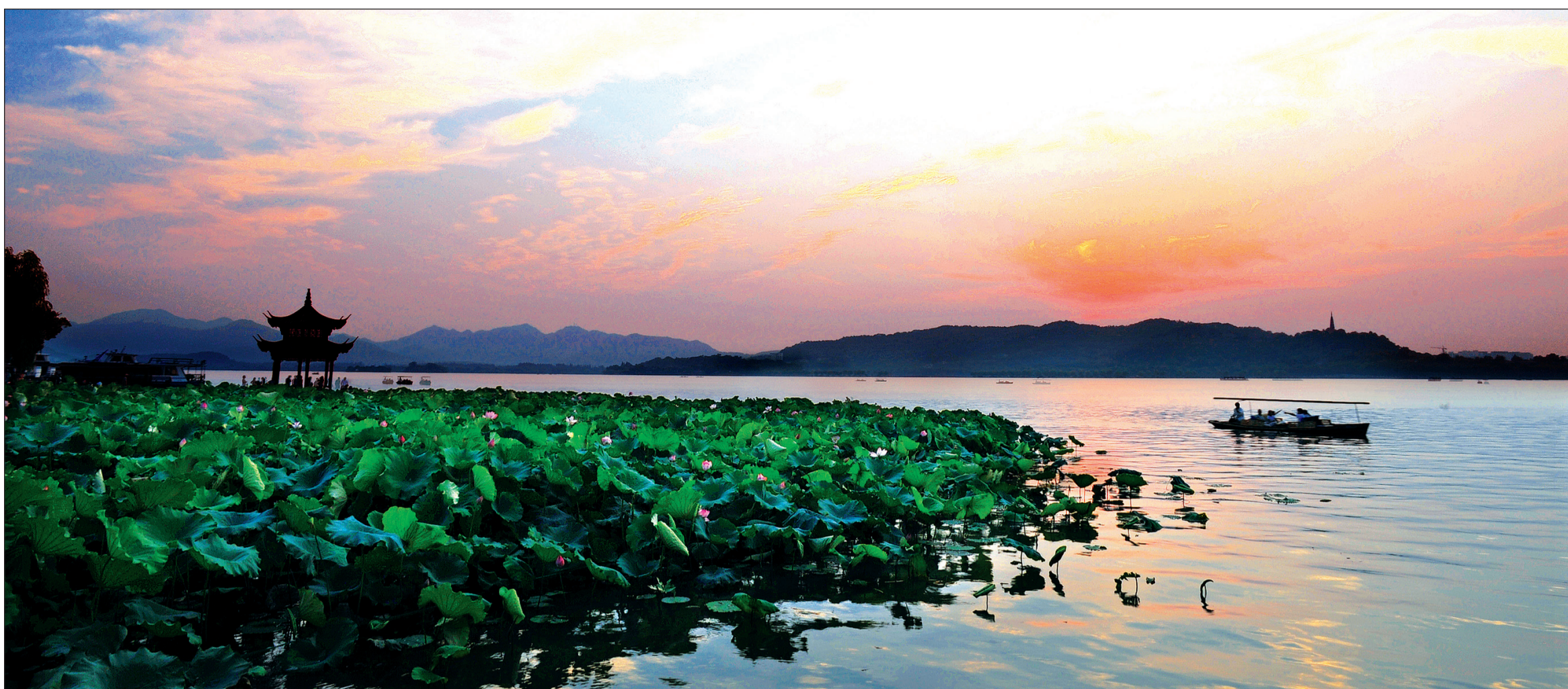
Located in the western area of Hangzhou's historic center, the West Lake is one of China's most renowned tourist spots.