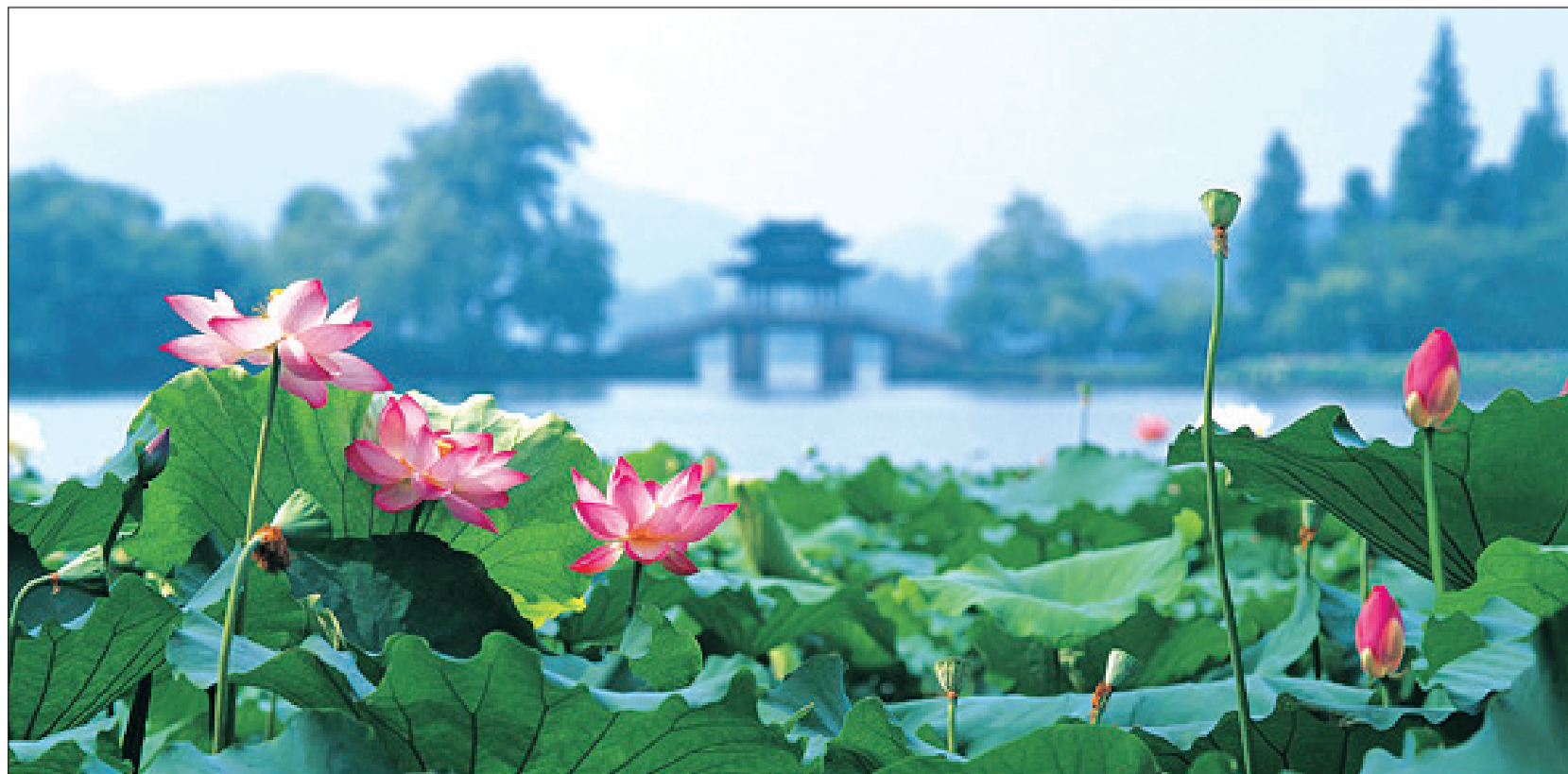
The city is famed for its lotus blossoms, which bloom in summer.