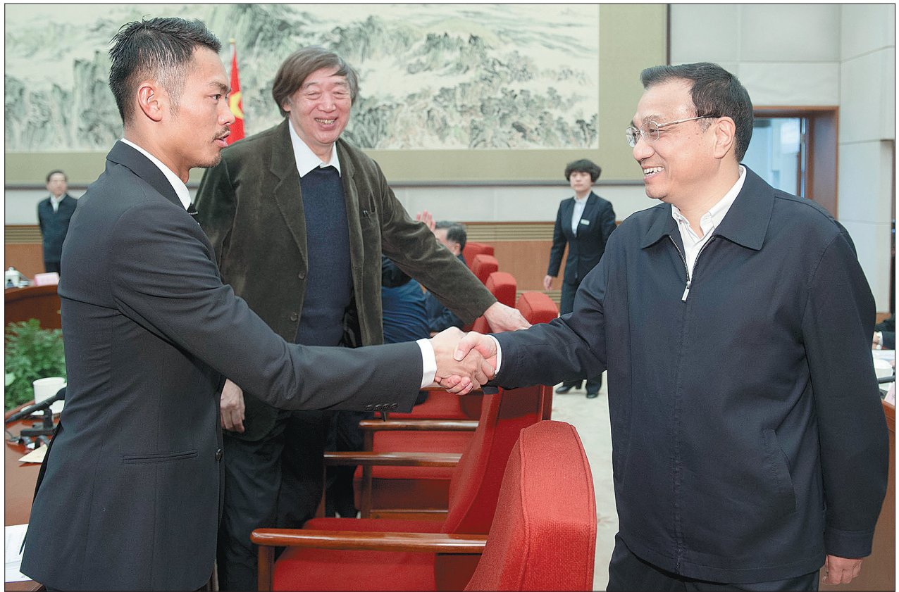
Premier Li Keqiang greets badminton Olympic and world champion Lin Dan, as writer Feng Jikai looks on, during a forum in Beijing on Friday. Ten representatives shared their views on the government's work in 2013 and made suggestions to improve the Government Work Report.

Source: National Health and Family Planning Commission