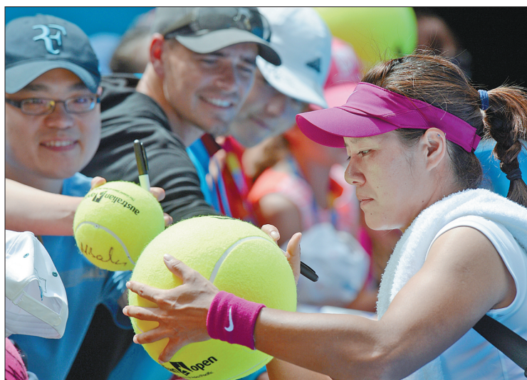
Li Na advances: Chinese tennis star Li Na signs autographs after winning her women's singles match against Ekaterina Makarova of Russia to reach the quarterfinals at the Australian Open 2014 tennis tournament in Melbourne on Sunday. > p24