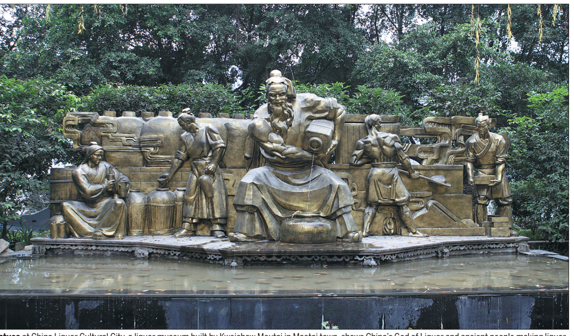
Statues at China Liquor Cultural City, a liquor museum built by Kweichow Moutai in Maotai town, shows China's God of Liquor and ancient people making liquor

The refined characteristics of the spirit are linked to its geographical origin. Moutai is distilled from sorghum and wheat in an area of rich soil with particular climate conditions that produce a unique