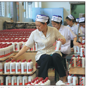
Workers at Moutai's packaging plant