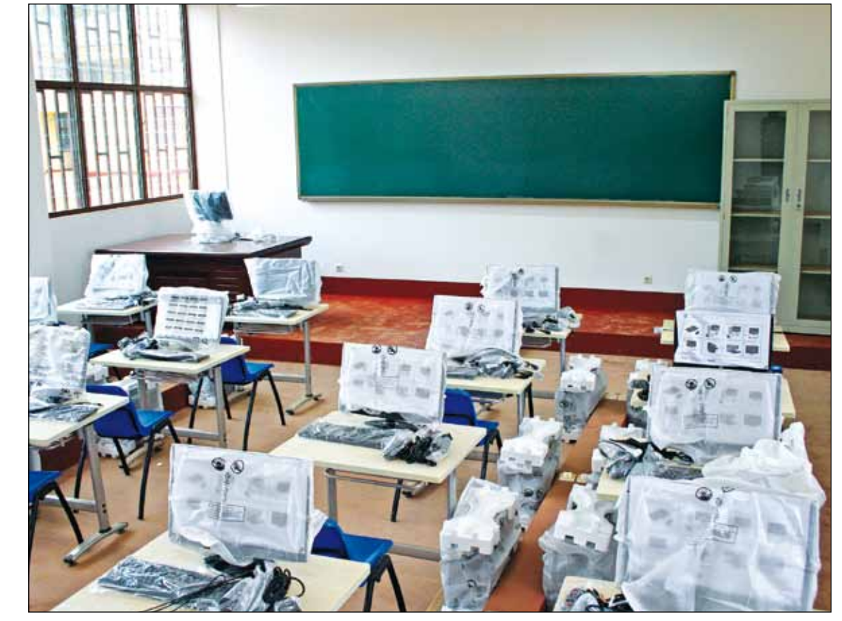
Computer class: teaching the next generation.