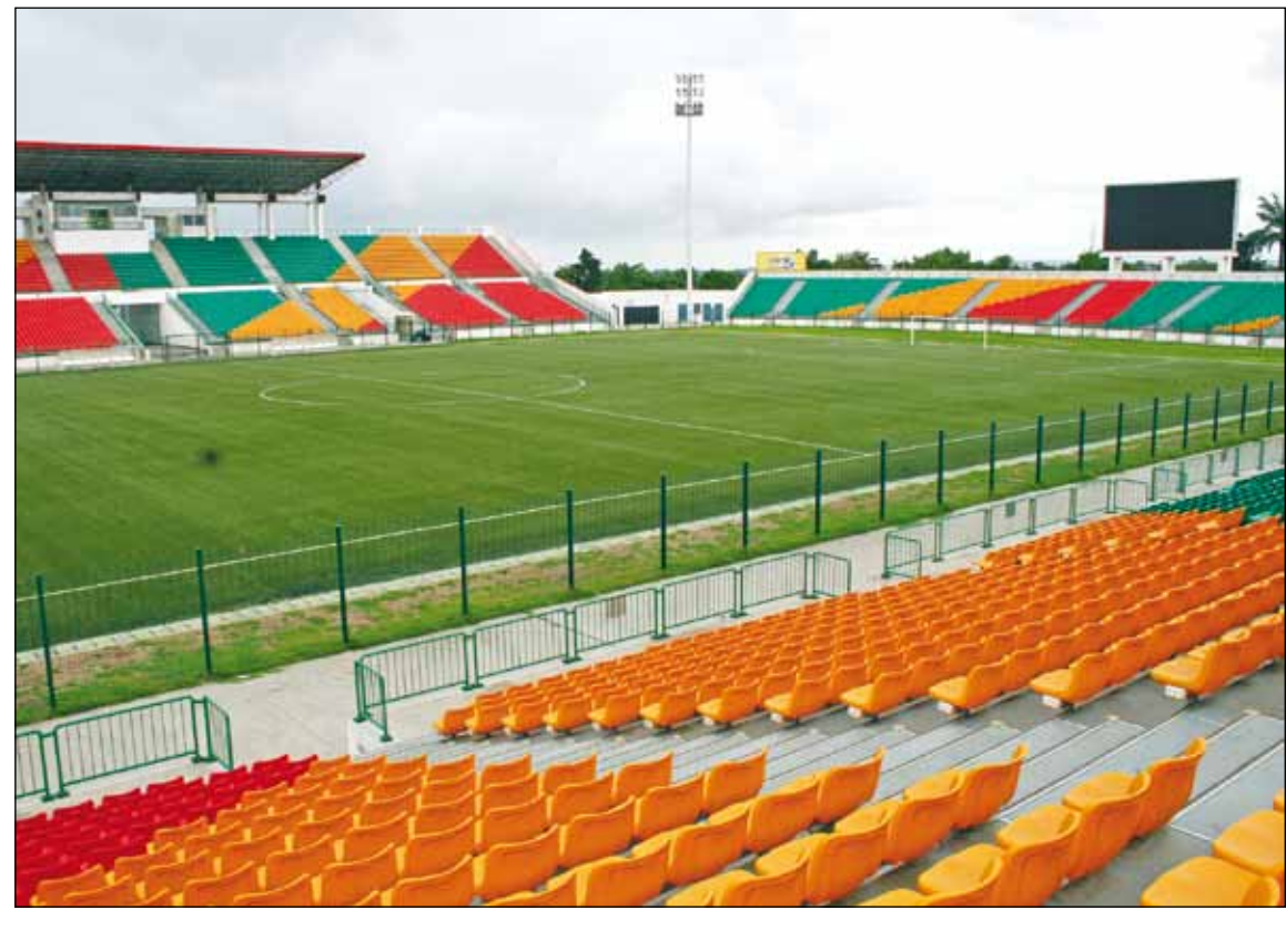
Sports Stadium at Pointe Noire