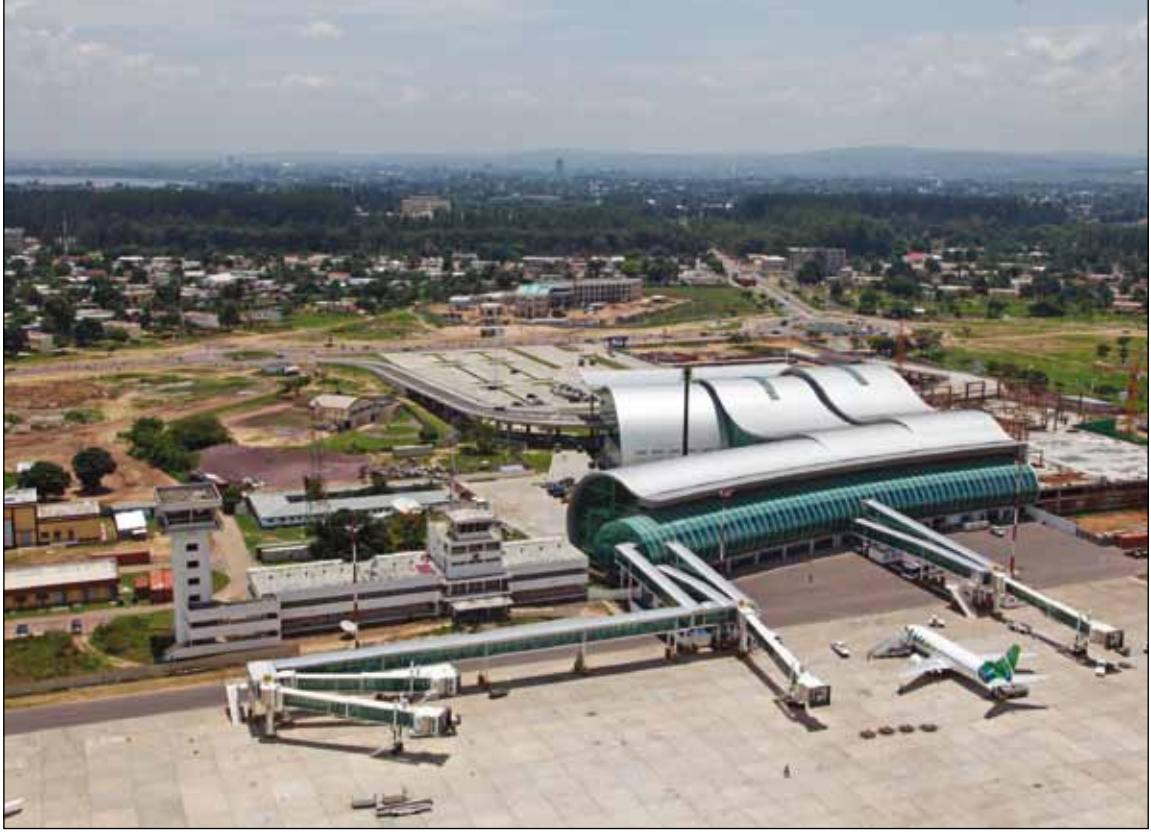
Maya Maya Airport