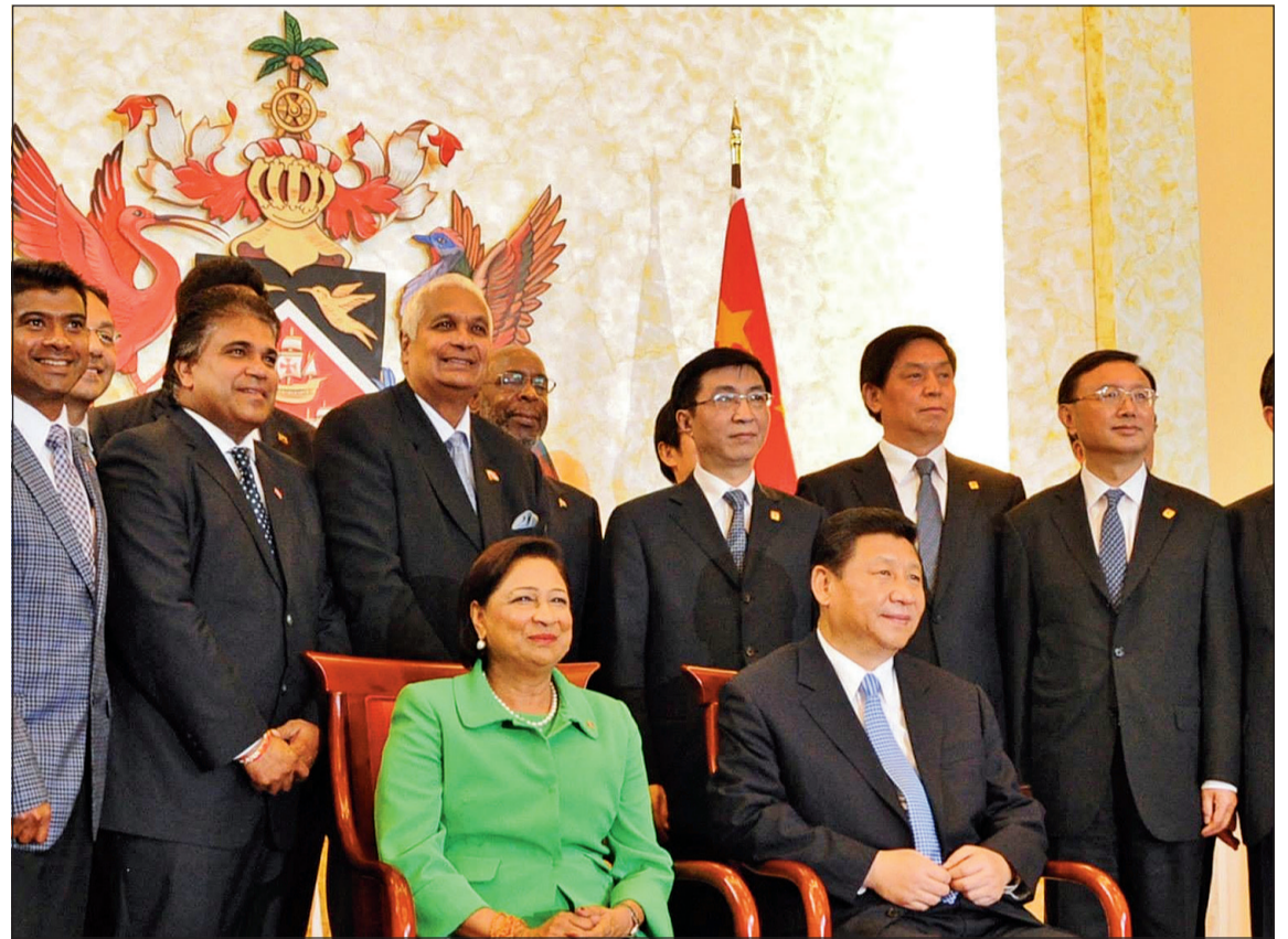
The Prime Minister of Trinidad and Tobago Kamla Persad-Bissessar with Xi Jinping, the president of China.

As T&T Finance Minister Larry Howai explained: "Our financial services sector has been one of the most dynamic and aggressive in the non-energy sectors. It has also been a very innovative sector, pioneering in services like mobile and internet banking among others, as well as corporate banking. I expect they will continue to make a very positive and strong contribution to growth over