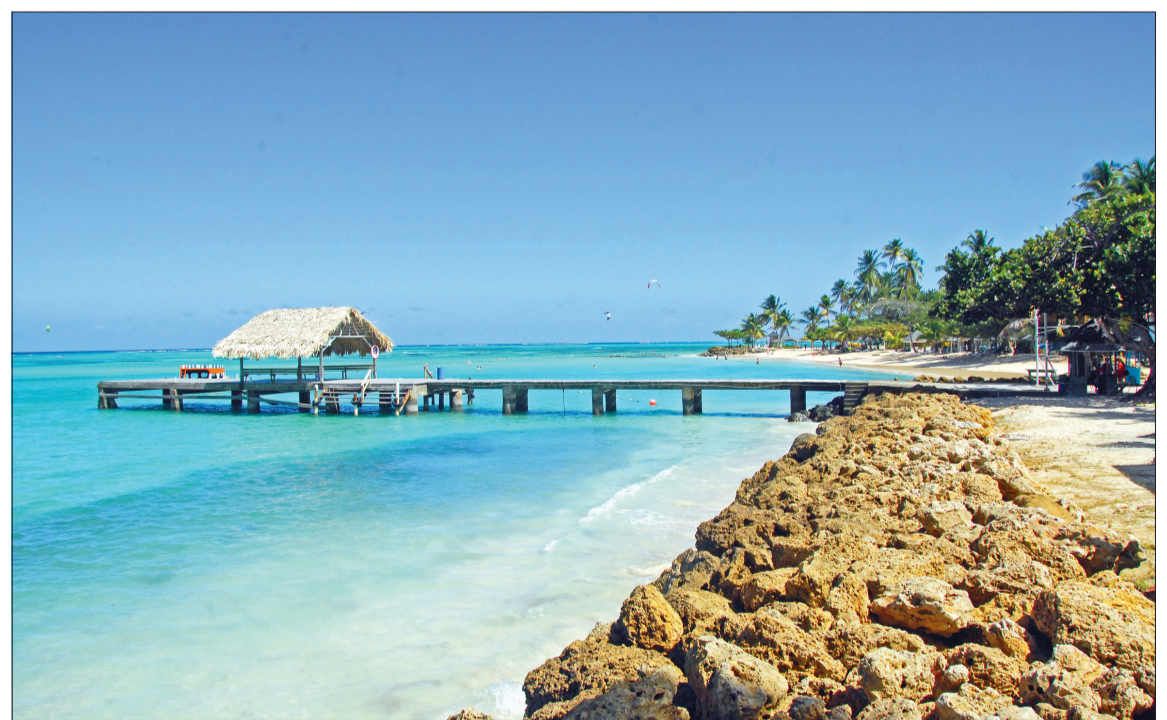
Pigeon Point beach and dyke.

"In an environment that is dynamic and competitive and so on, we are looking at brand loyalty; the type of loyalty that is based on a predictable product. We buy Coca-Cola and KFC because we are loyal to their brand. In tourism, however,