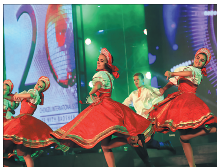
The city of Pengzhou has hosted a number of international cultural events in the past years.