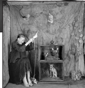
Snagged, a photo by Ballen.