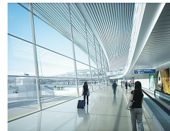
Artistic rendering of the new airport in Chengdu.