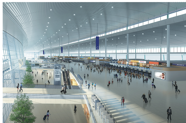
The new airport will handle 40 million passengers annually by 2025.