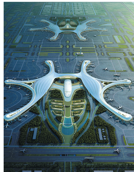
An illustration of a bird's eye view of the new airport in Chengdu.

The highway network will shorten the driving time from Chengdu to Chongqing to within three hours; to Xi'an, Kunming, Guiyang and Wuhan to within eight hours; and to the Yangtze River Delta, Pearl River Delta and the Bohai Rim area to within 20 hours.