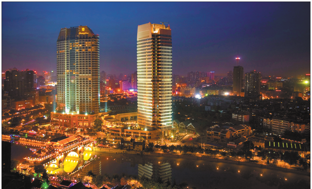
The iconic Shangri-La Chengdu. More international hotel brands are expected to open in the city following the 72-hour visa-free policy.