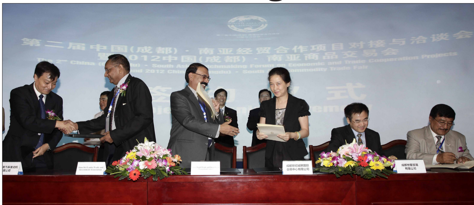
Trade representatives from South and Southeast Asian countries have business talks and sign cooperation contracts with their Chinese counterparts at the second China-South Asia Economic Trade Cooperation Fair in Chengdu.

exports to South Asian countries reach $1.1 billion, an increase of 10 percent.