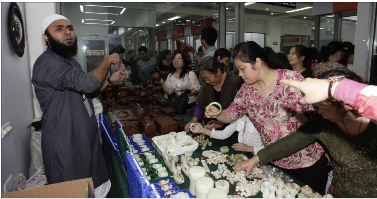
Commodities from South Asian countries on display at the fair are popular with visitors.

In addition, the domestic market in China has a large demand for raw materials, such as iron ore, manganese ore, copper and coal, which are abundant in South Asian countries. Together with other commodities like jewelry and jade, they account for a large portion of Chengdu's imports.