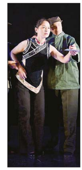
OCTOBER 12 Shanghai Dramatic Arts Centre