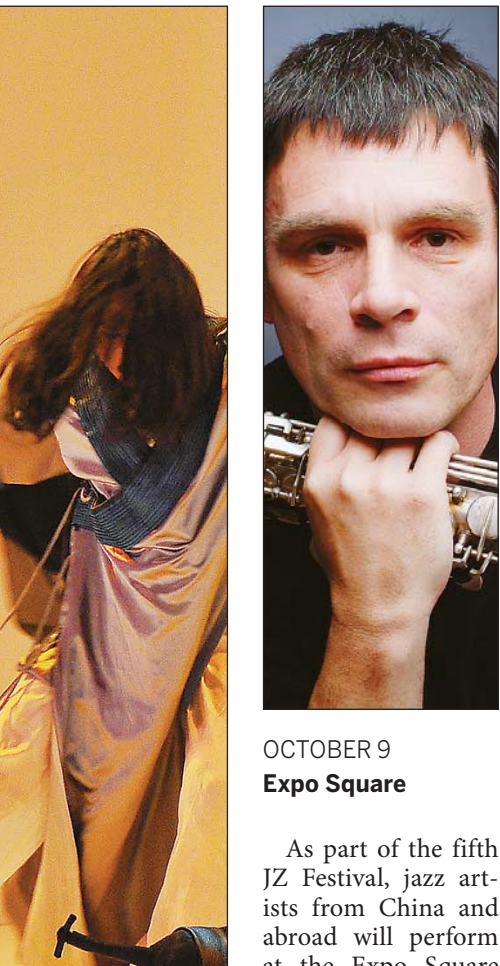
OCTOBER 8 Expo Center

Ten Parties, a show that presents the quintessentials of Chinese culture - water-ink painting, tea ceremony and dance drama inspired by ancient Buddhist sculptures in the grottoes of Dunhuang in Gansu province, will premiere at the Expo Center.