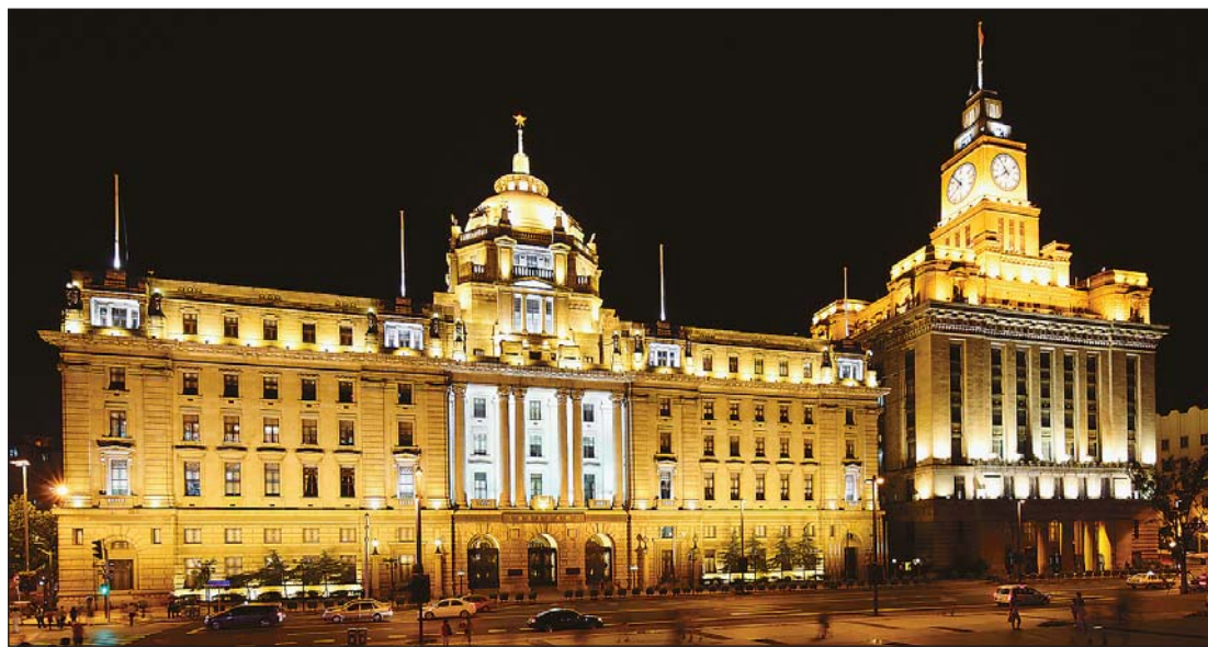
The Shanghai Pudong Development Bank, an iconic building on the Bund, is illuminated by numerous lights.