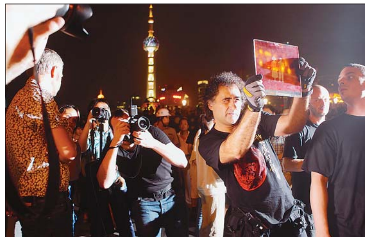
World-renowned Swiss lighting artist Gerry Hofstetter prepares for a light show in Shanghai.

memorials to increasing problem of global warming.