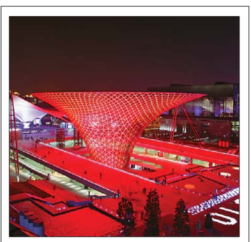
Red illumination at the Expo Axis.

A young girl tries walking in a giant shoe in the Expo Garden. The 50.6-meter-long "board shoe", presented by the Guangxi Zhuang autonomous region, is said to be the longest of its kind in the