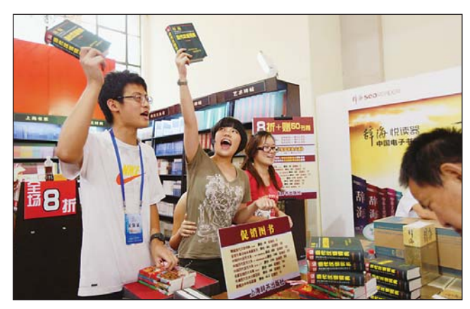
Employees of Century Publishing Company hawk dictionaries at the Shanghai Book Fair.