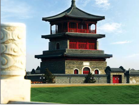
The Wenchang Pavilion in Shengfang, a town dating back to the Spring and Autumn Period (770-476 BC).

Contact the writers at liuxiang@chinadaily.com.cn and lifusheng@chinadaily.