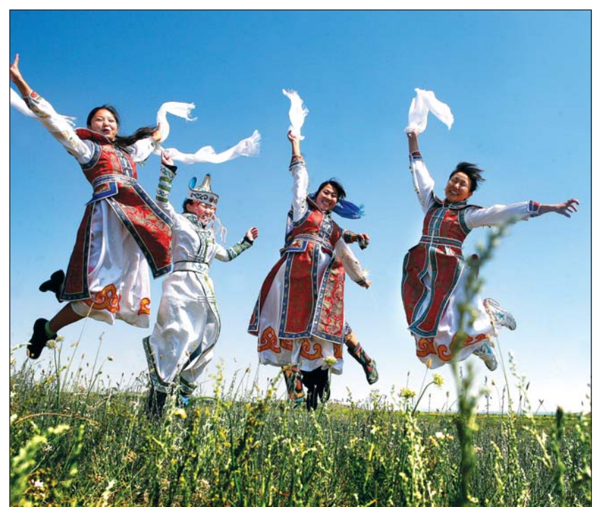
The music festival held on 100 hectares is now well established as the largest outdoor music gala in China.

Organized by the Zhangbei government and InMusic, an influential music