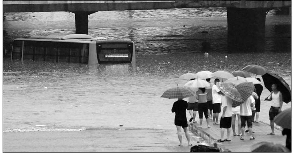
A bus is almost submerged in Tianjin on Thursday. Heavy rain, widely forecast, bypassed Beijing on Wednesday but battered the neighboring city.