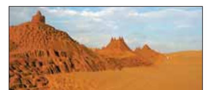
Sand Sculpture Gardens at the Gobi Desert's Singing Sand Ravine Tourist Scenic Spot.

The only thing missing was a pool. And while the price was fairly steep, it was certainly worth it.