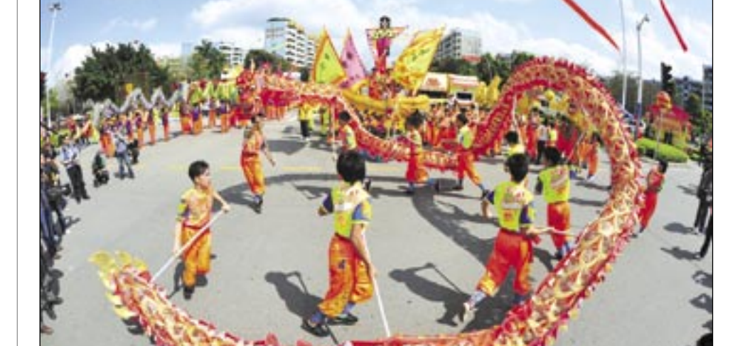
Local folk artists perform dragon dance during the charity parade.

Zheng wrote that the World Expo would bring numerous benefits to the people and the nation, and help improve techniques, products and businesses in China.