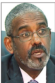
Nasr Eldin Ahmed, president of Sudanese Petroleum Pipelines Holding Co Ltd

Earlier this year, SPPHC, which has total assets of $187 million and more than 600 employees, embarked on a major expansion drive with the launch of three new subsidiaries