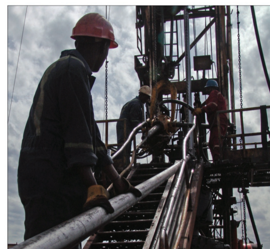
GNPOC is Sudan's premier oil and gas company.

"We build schools, hospitals, provide agriculture support, and supply clean water," stated Chen. "We maintain good relationships with local people."