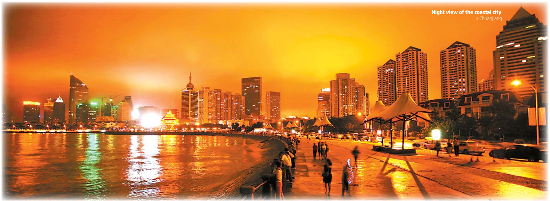
Night view of the coastal city Ju Chuanjiang