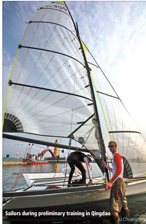
Sailors during preliminary training in Qingdao Ju Chuanjiang

The throughput of containers realized by the city's port was also among the world's top 10 last year.