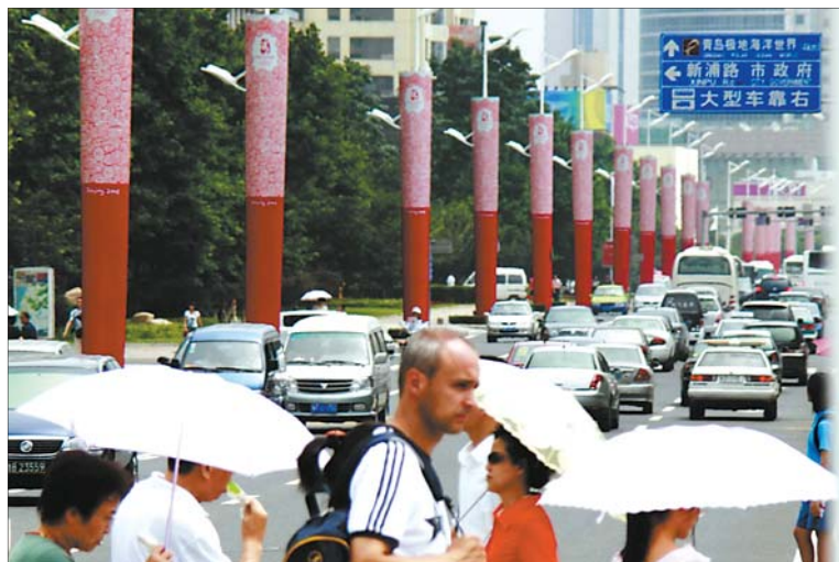
A street close to the Qingdao International Sailing Center features 154 streetlamps shaped in a specially designed torch. Ju Chenghao

All these efforts showcase the city's readiness and joy to provide the best service and to present a wonderful sailing competition.