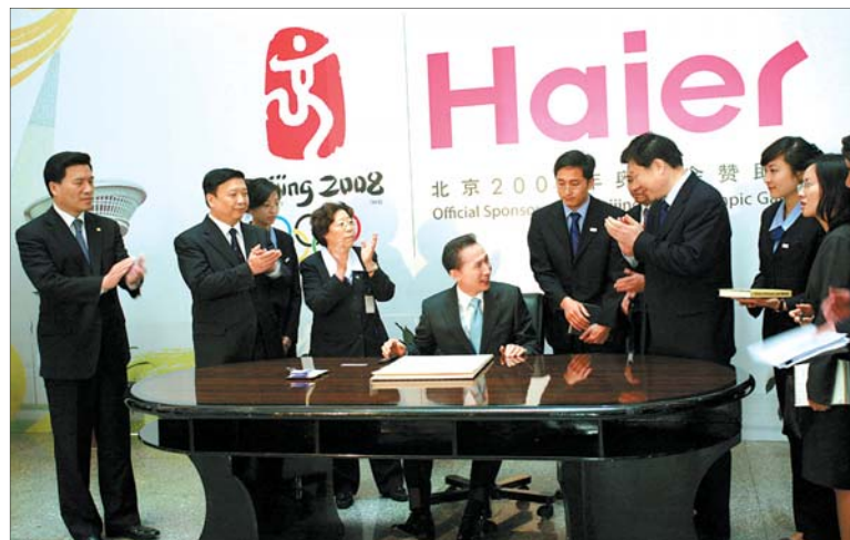
President of South Korea Lee Myung-bak (center) visits appliance giant Haier's headquarters during his tour of Qingdao on May 30.

The first APEC METC was held in Japan in 1996. Qingdao also held the third APEC METC in 2004.