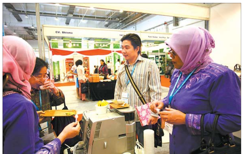
Tasting Indonesian coffee

For the convenience of customers, there are also areas set aside for international purchasing negotiation as well as pavilions housing electronic commerce, international logistics and famous international corporations.