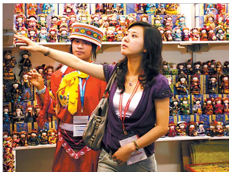
Arts and crafts from Guizhou province are popular among visitors.

"Passengers from both home and abroad will enjoy complete and excellent public transport services during the Olympic Games sailing competition and beyond," Zhao said.