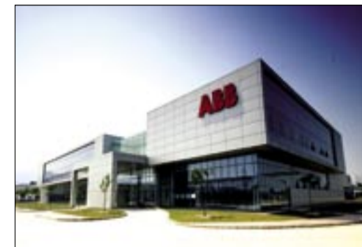
PROVIDED TO CHINA DAILY